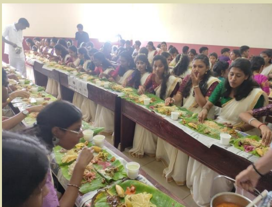
Fig. 5 Onam Sadya

On 28 th August 2023, we celebrated Onam and students and staff were encouraged to come in Onam dress as part of commemorating our cultural diversity. Pookalam was put and students danced which was followed by a sumptuous Onam Sadya (feast). Many traditional games were also played on that day.