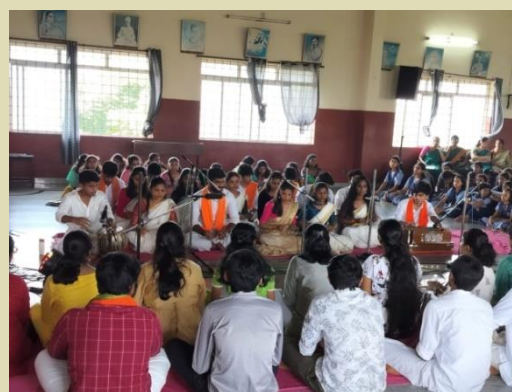
Fig.18. Bhajane – Sharada Puja

Sharada, the goddess of learning is specially revered during the Navaratri times according to ancient Indian scriptures. Sharada Puja is held in institutions to invoke the blessings on Goddess Saraswati for higher learning prospects. Sharada Puja at the college was conducted on 20 th October 2023 at the auditorium. After the puja, prasada was distributed to all the students and staff. Students and staff performed bhajane on the occasion in the accompaniment of musical instruments.