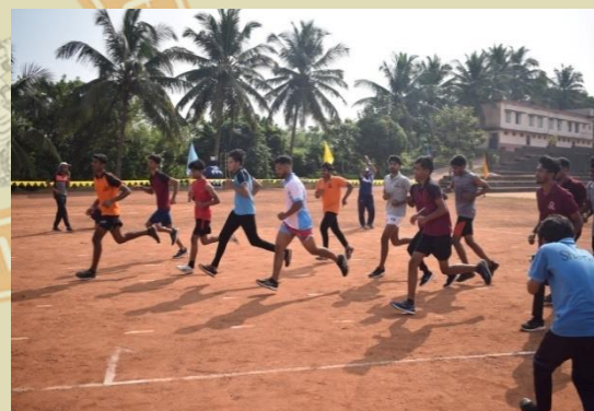
Fig.28. Athletic Competitions