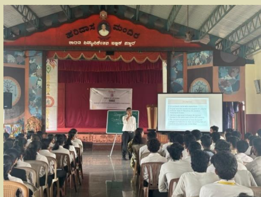
Fig.17. Students' Presentations