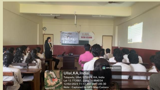
Fig.27. Students' presentations

presentations including PPT to the college students and staff. An elaboration on Bhopal Gas Tragedy and the pre-crisis and post –crisis methods were discussed as a case study.