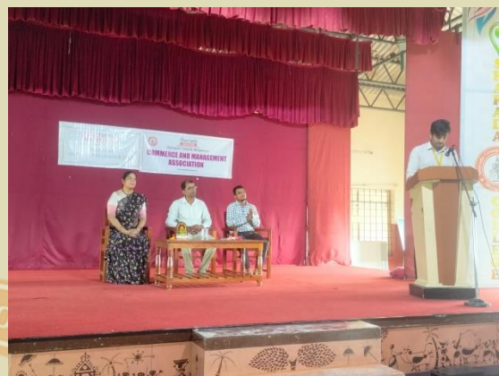
Fig.15. Investor Awareness programme

He stressed the importance of early savings for youngsters, especially so, in the equity market. The statistics of financial management was clearly illustrated.