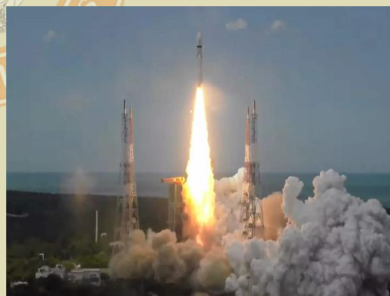
Fig.10. Chandrayan Launch (internet image)

Bharat was able to successfully land the rover on the moon's surface near the South Pole on 14 th July 2023. The video about Chandrayan-III's success and in order to make the students aware about Vikram's landing the documentary was shown. Further, the students also made chart presentations on the topic, 'Indian Achievement on Moon'. The event was