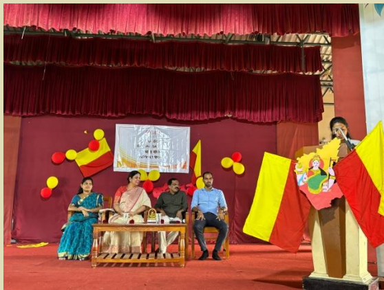
Fig. 22. Kannada Rajyotsava Celebrations