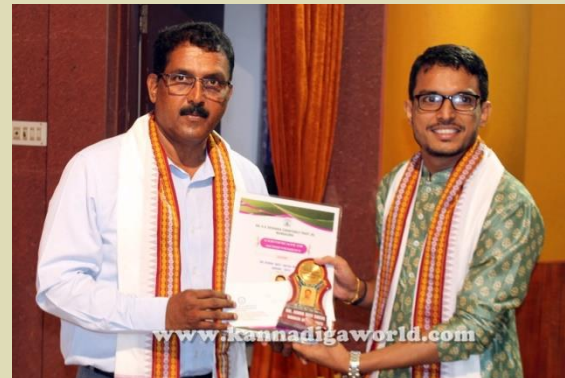
Fig.33. Best Social Worker Award

He also received the Sri Ashok Best Social worker Award by Dr. K.V Devadiga Charitable Trust on 26 November 2023.