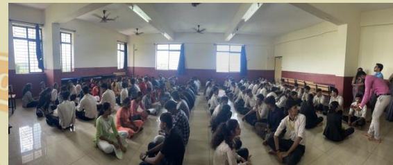
Fig. 6 Girls tying rakhi to boys

Rakshabandhan, the festival of peace and harmony revolves around the sanatana concept of protecting sisters. Therefore, on the 30th August 2023, Rakshabandhan was celebrated in the campus.