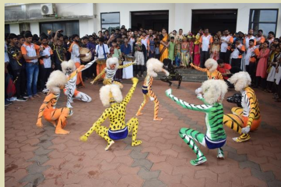
Fig.9. Tiger dance by our students

( huli vasha ), Nasik band, Chende mela , and such cultural celebrations were also performed.