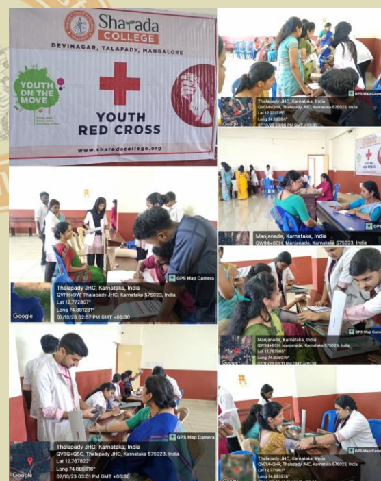
Fig.21. Collage – YRC Free Diabetes Screening

Youth Red Cross Unit of the college conducted a free diabetes screening in association with Sharada Yoga & Naturopathy Medical College & Hospital. Many members registered and took benefit of this opportunity extended to them. The