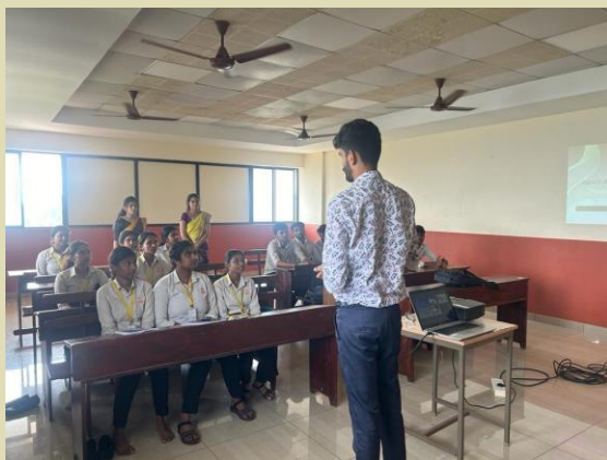
Fig.19. Session on ML

The session was very interactive where students asked a lot of doubts. It was conducted by the IT Association of Sharada College.