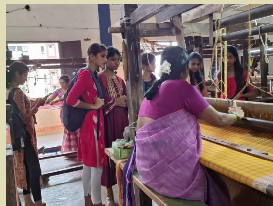
Fig.3 The weaving process

On 26 th August the students were taken to Paperseed Village, Pakshikkare and Udupi Handloom Sarees, Kinnigoli. Students had the chance of interacting with the entrepreneurs and they asked a lot of