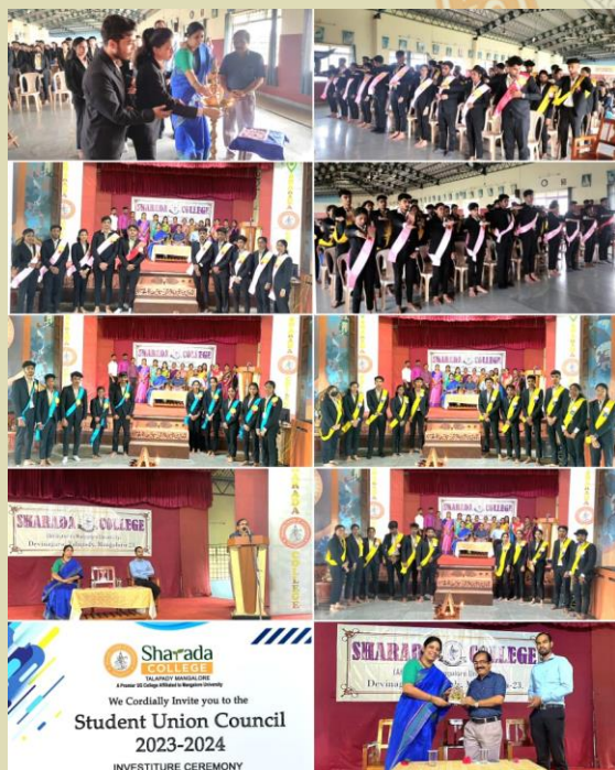
Fig.14. Collage of the event

The election was done in a democratic way using a ballot system and the students were given the opportunity to 'Ask the Candidate'.