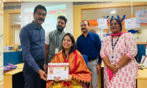
Fig. 34. Shiksha Ratna Award