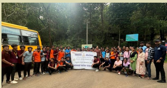
Fig.23. Trekking Camp

NSS organised a trekking camp for the students to Gadayi Kallu, Belthangady on 10 th November, 2023. The students did the trekking with great enthusiasm and after