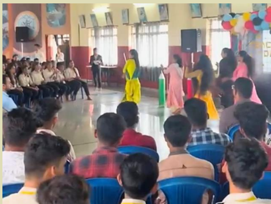
Fig.8. Teachers Day Activities

Since we were not able to celebrate Teachers' Day with our students, the students of Sharada College organised an event for their teachers on 11 th September 2023.