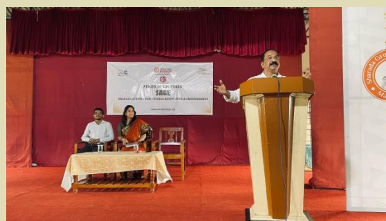
Fig.16. SAGE Inauguration

A new Lecture Series by the name of SAGE-