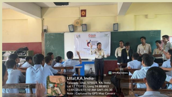
Fig.26 Our students in Extension Activity