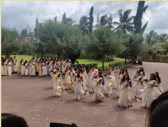
Fig.4 Onam Dance