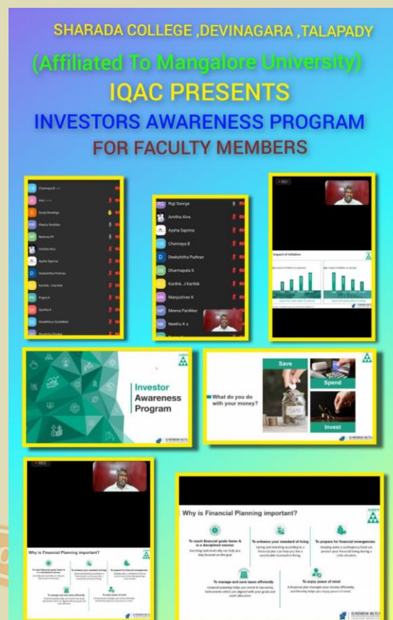
Fig.12. Screenshots of Online Prog.

Truly, the session was an eye opener for many who did not know that investment schemes existed as deviated from the traditional ones.