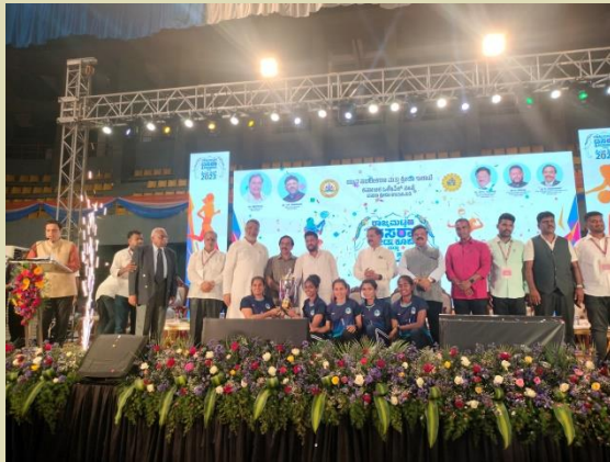
Fig.31. Dasara CM Cup Hockey