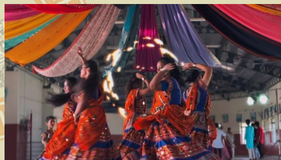
Fig.25. Dandiya Celebrations

Diwali, the festival of victory, joy and lights was celebrated from 12-14 November 2023. On 11 th November, 2023 Dandiya evening gave vibrant colours to the young dancers dressed in colourful attire dancing to the rhythmic garba tunes. There was a special performance of teachers as well. This was organised by the Students' council along with the Fine Arts Association.