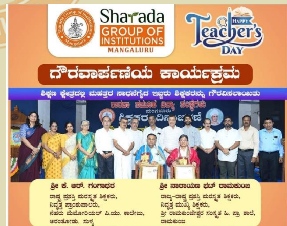
Fig.7. Teachers Day Celebrations