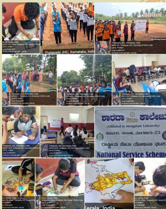
Fig.20. Collage – Unity Day Photos

The NSS unit of the college conducted Unity Day to commemorate the birth anniversary of Sri Sardar Vallabhai Patel. The theme of this year was 'Run for Unity' and after taking the Rashtriya Ekta Divas Pledge, the students participated in the Unity Marathon to spread the message of