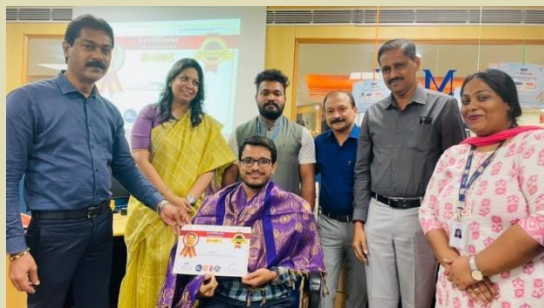
Fig.32. Shiksha Ratna Award on 04.10.23